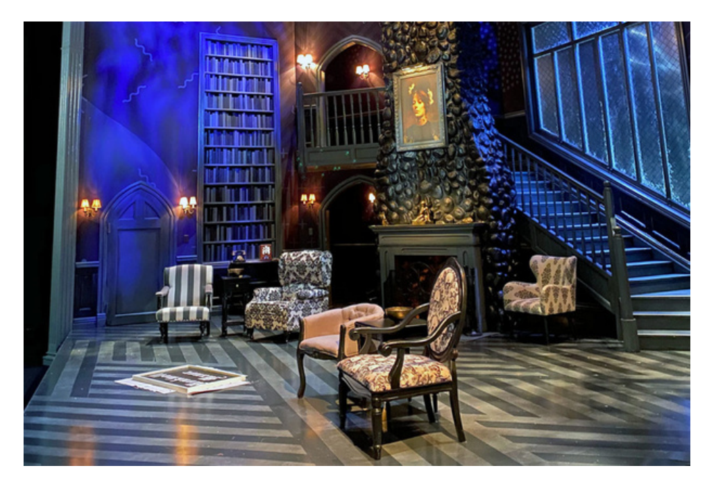
Court Theater / Photo by Jessica Mlinaric