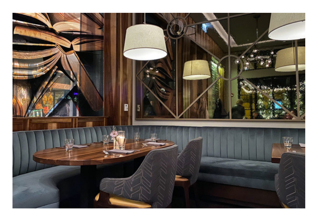
Mesler Kitchen